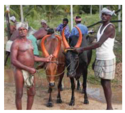
Horns decorated for Pongal

Pongal is the traditional harvest festival during the month of Thai (Mid January). Farmers / livestock keepers celebrate this day, exclusive for a good harvest and for as a thanks giving for the livestock. The cattle are washed, poon kavi applied on the horns and back. Poon kavi is a particular type of red soil. Turmeric leaves and Poola poo are tied to the cow's horn. Sarkarai Pongal (Sweet Pudding) is offered to the cows and bullocks in kottai muthu (Castor) leaves.