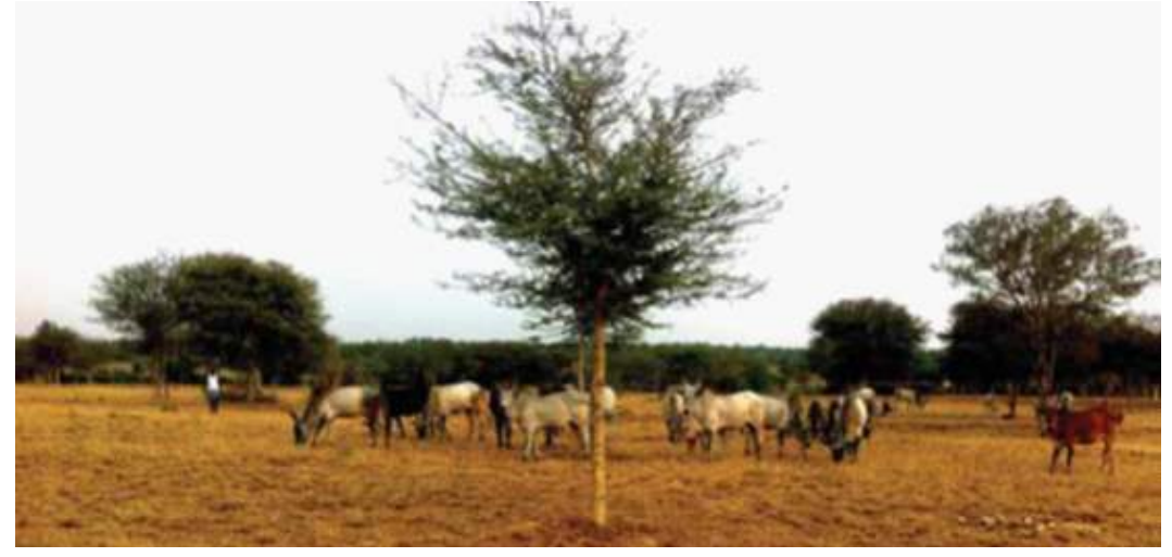
Cattle grazing in Korangadu

A reconnaissance survey of the present day tenure arrangements associated with Korangadu was carried out to understand existing patterns of use. Small holders and landless 'lease in' Korangadu