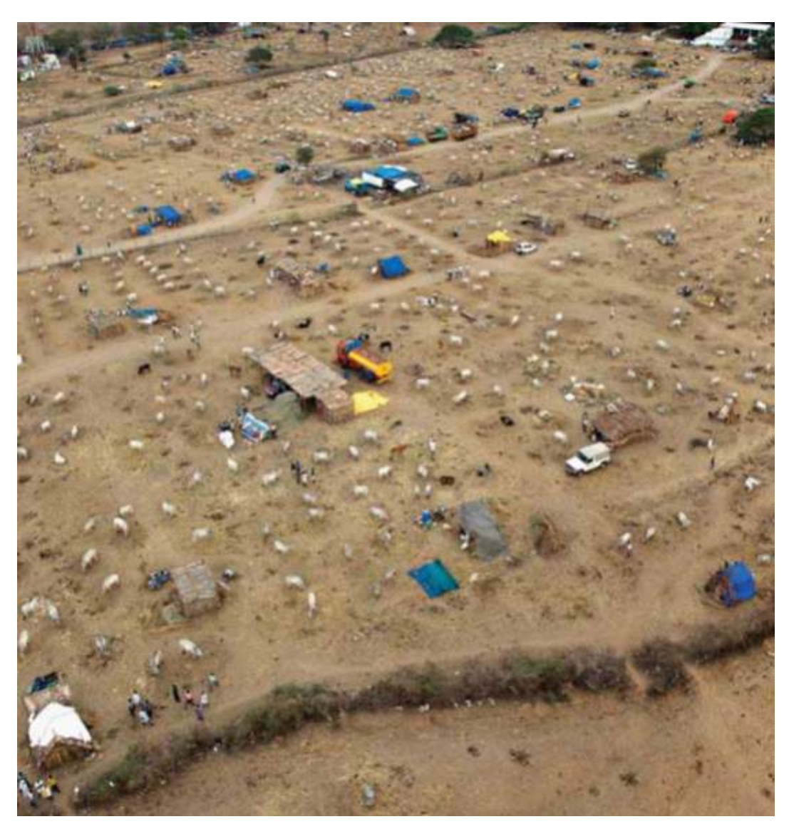
Aerial view of Kannapuram Cattle Shandy

shandy (Mattuthavany) is held once annually in Kannapuram village for seven to 10 days during the Tamil month of Chithirai (April) and coincides with the "Temple car Festival" (Ther thiruvila) of Mariamman Temple, another temple adjacent to the Vikramacholisvara temple on Chithra pournami day (Full moon day of 'Chithirai' of Tamil month).