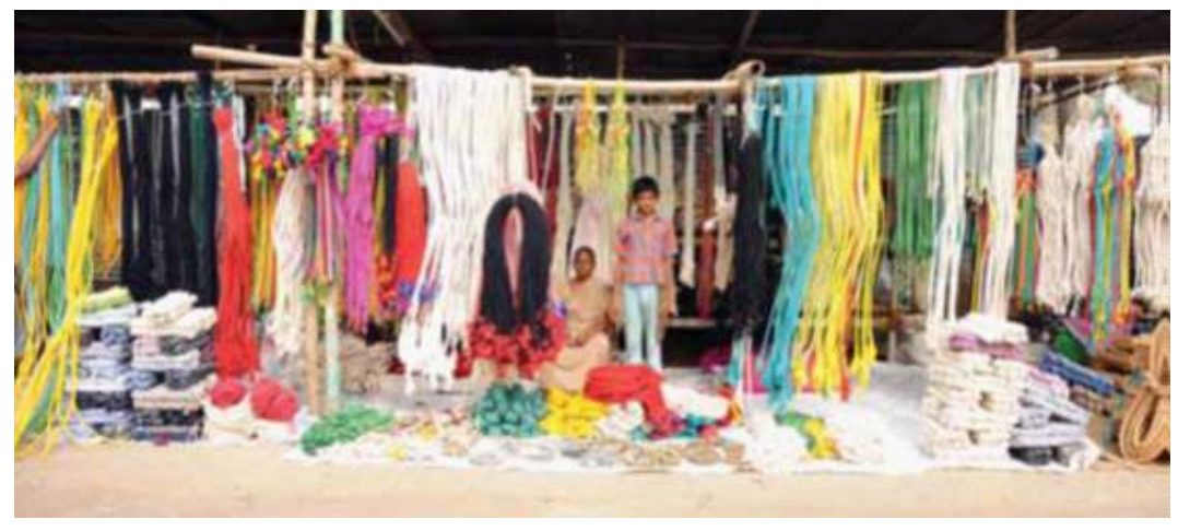
Cottage products related to Kangayam sold at Kannapuram Shandy

As part of the annual temple car festival people congregate in large numbers. Culturally this was a time for festivities, trading and transactions. Nearly 30,000 animals are brought to the shandy every year, and a decline has been reported.