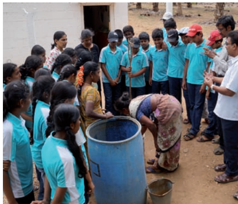
Young visitors from KSIRS, Coimbatore