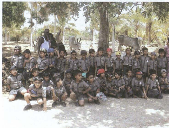
Students from Kovai Vidyasharam

September 09 2014- Standard 1 & 2 students visited the cattle farm.