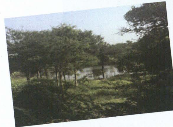
Korangadu after good rains in June 2014.